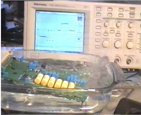
The ultimate ruggedness test